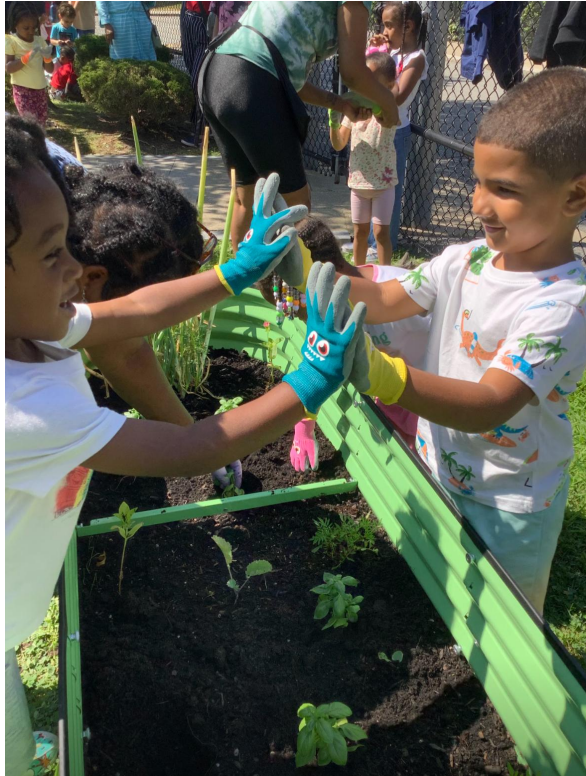
Students at ABCD Head Start Planting Day in Dorchester in June 2024