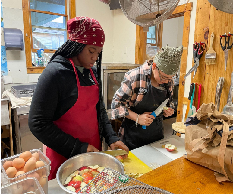
Prospect Hill Academy 9th graders preparing food during their field trip to The Farm School in Athol, MA in Spring 2024.