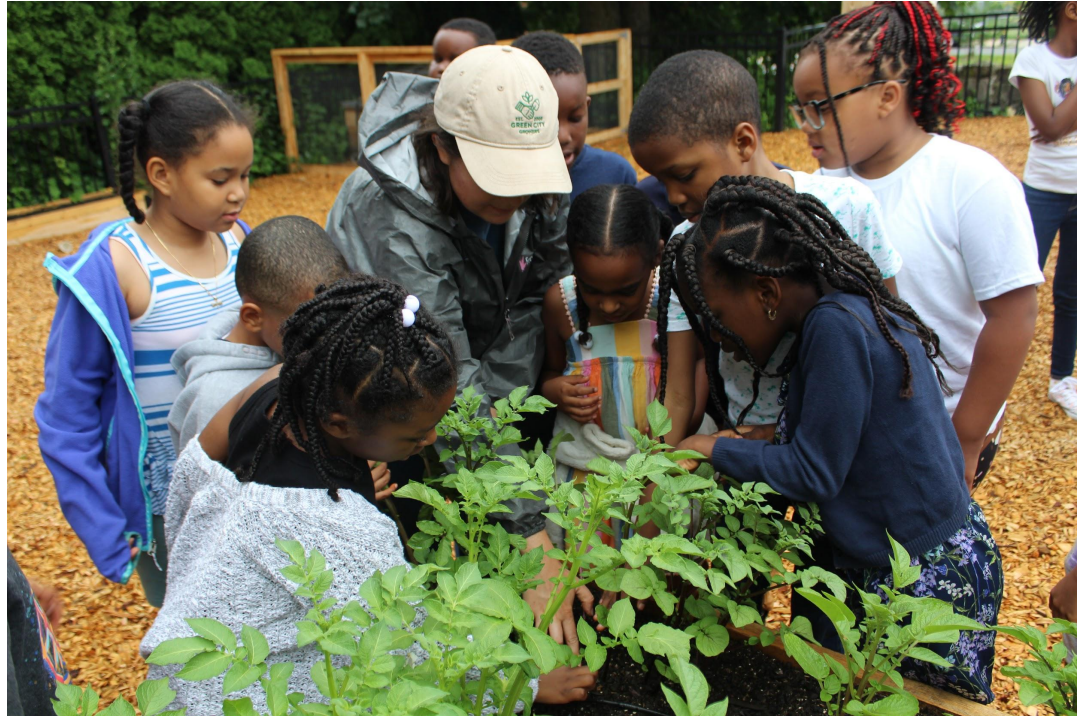
Students at Bridge Boston working in their new school garden with Green City Growers, Spring 2023

Subscribe to our newsletter and stay up to date on upcoming webinars and other professional learning opportunities.