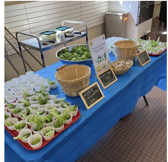
Northampton Public School holds a local crop taste test in the cafeteria..