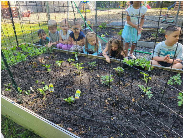
Pre-K Students from Assonet Child Development Center tend to their plants in their new school garden, Spring 2023.