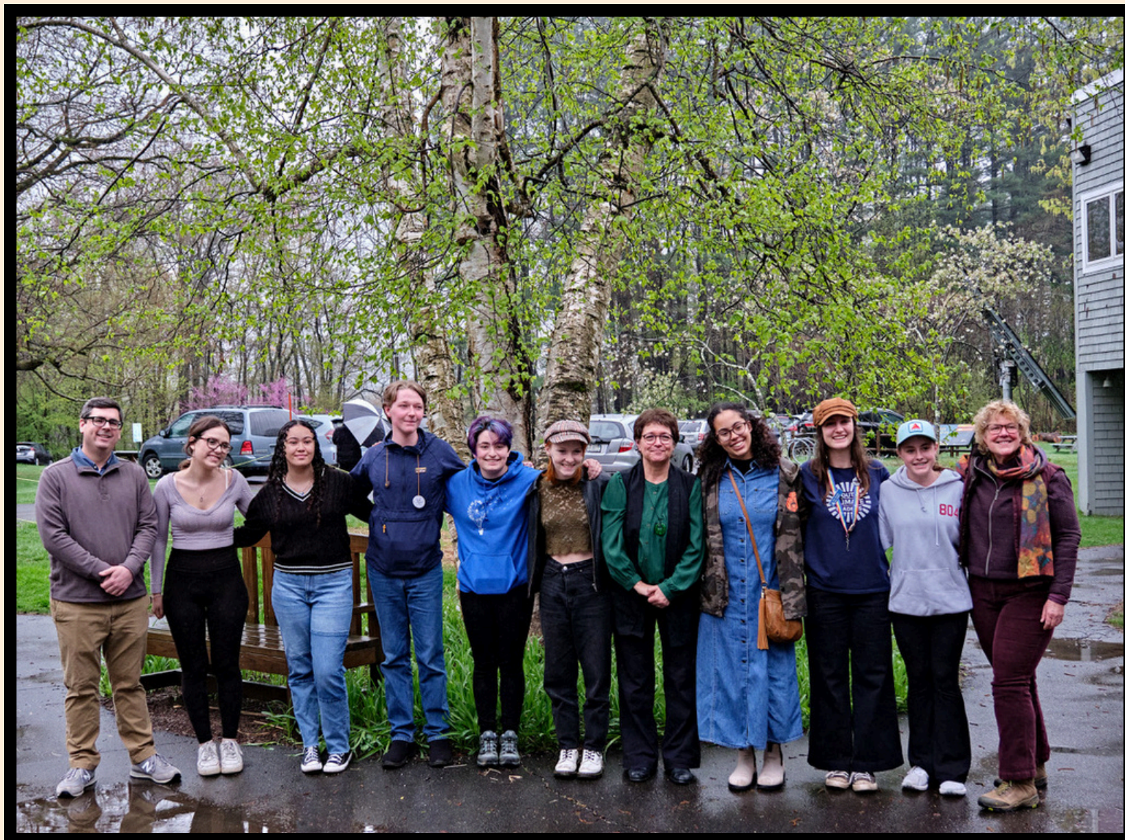
Creative Climate Action Festival, 2023