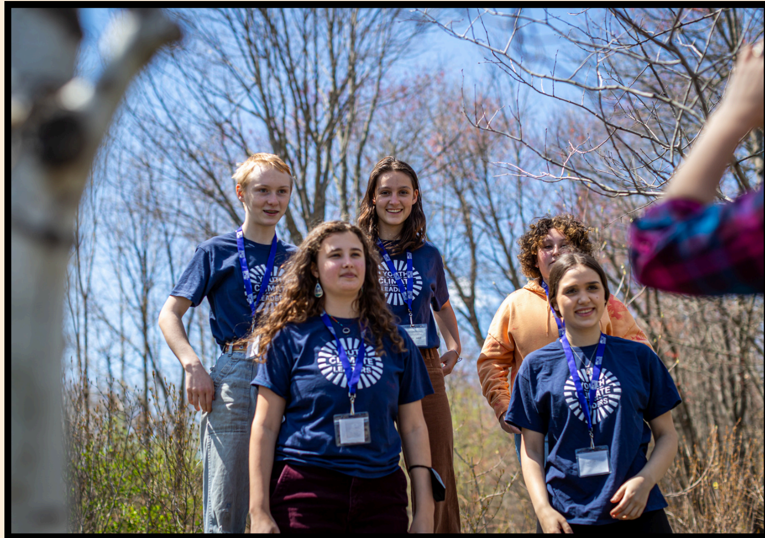
Youth Climate Leadership Summit, 2023