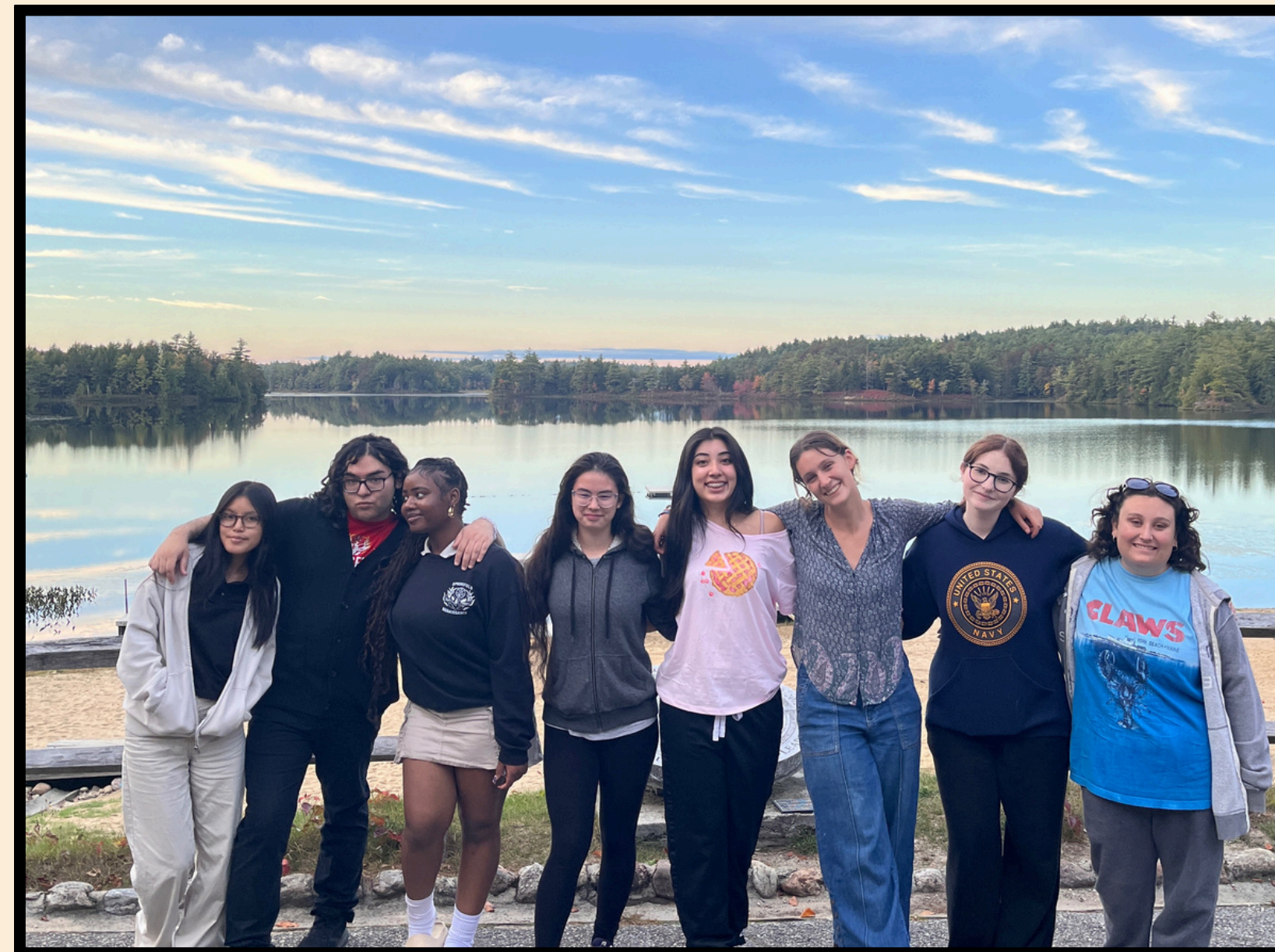
Statewide YCLP Leadership Retreat, 2024