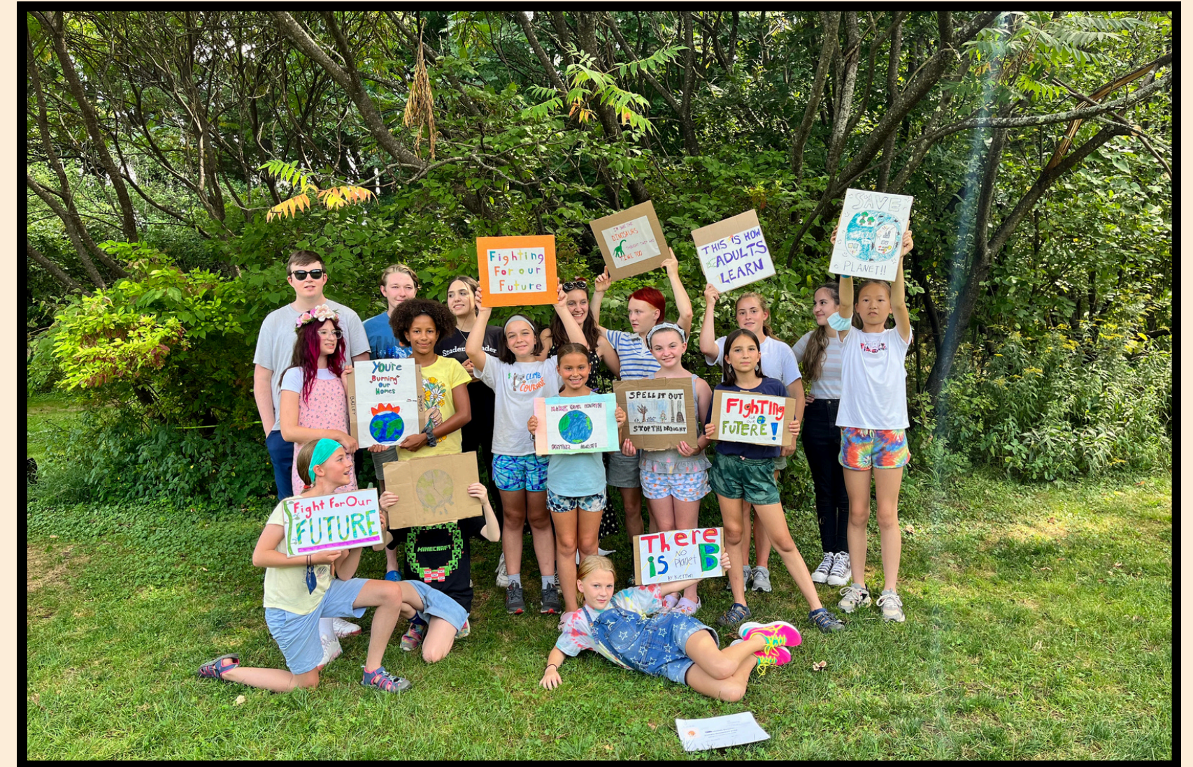
Little Leaders Summer Climate Convention, 2022